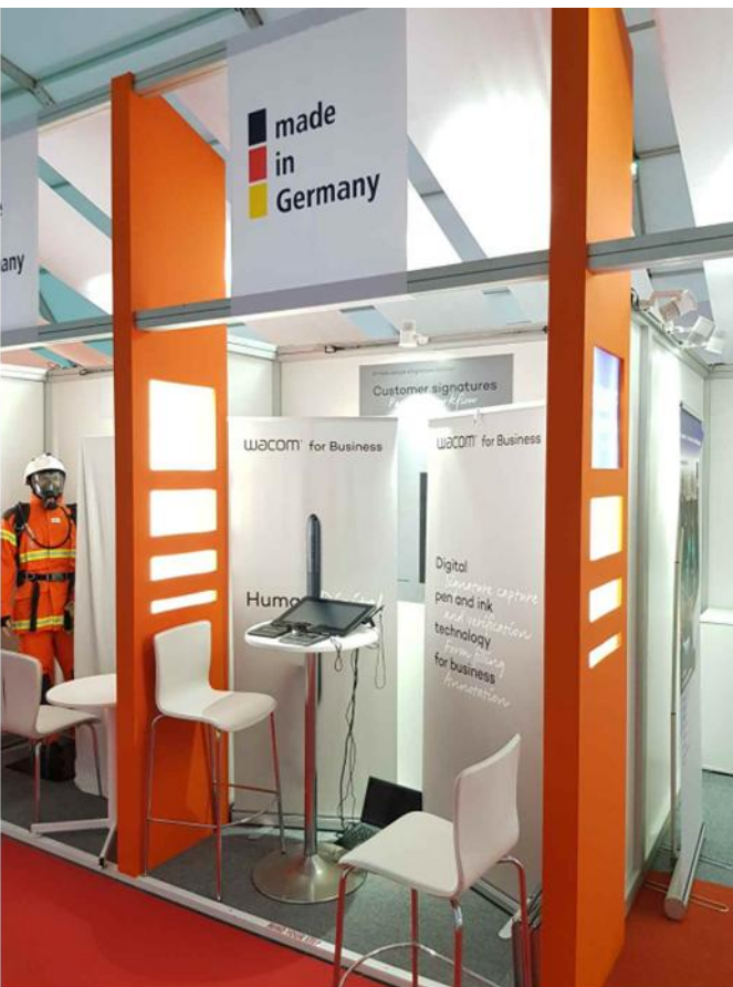
Firmeneinzelstand IZ, 2 m 2