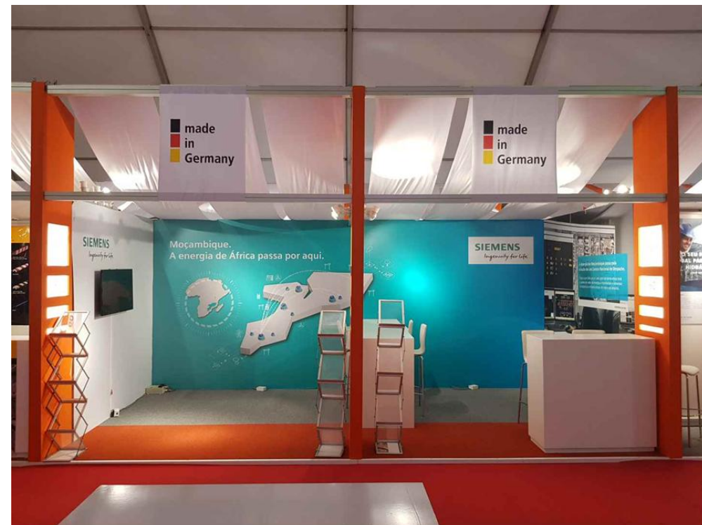
Firmeneinzelstand 18 m 2