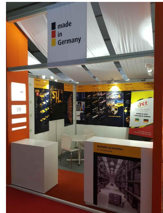
Firmeneinzelstand 9 m 2